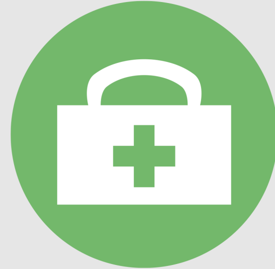
Humanitarian Aid 2006