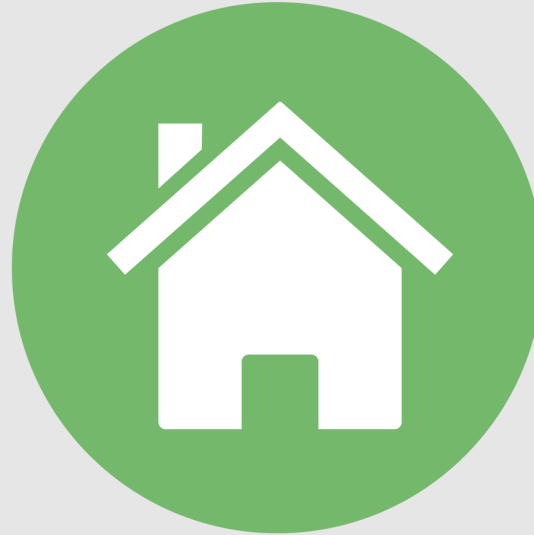
Home Care 2001