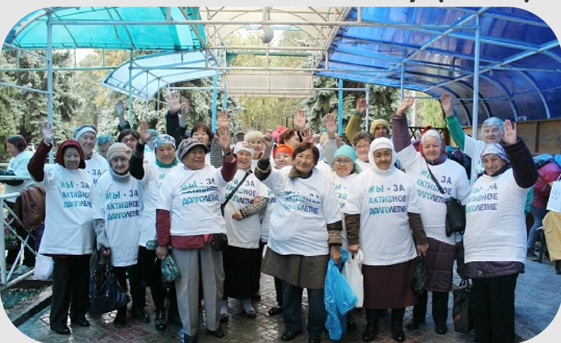
International older persons day celebrations with the mayors office in Bishkek city (2017)