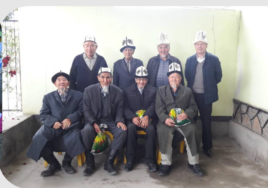
Holding of the holiday of spring with the mayors office in Batken city (2018)