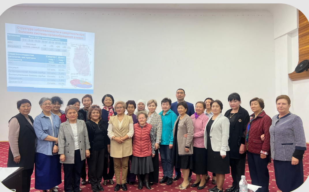
Holding of tranings on geriatric care for doctors (May 2022)