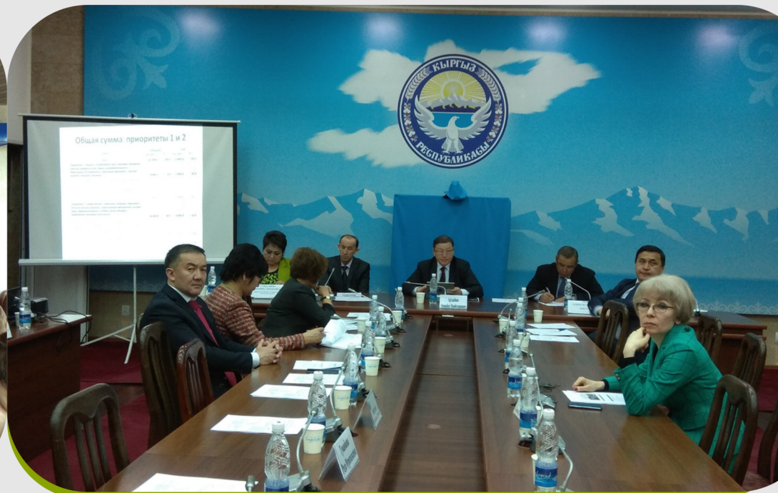
Establishing of the platform Active Longevity in the Parliament (2017)