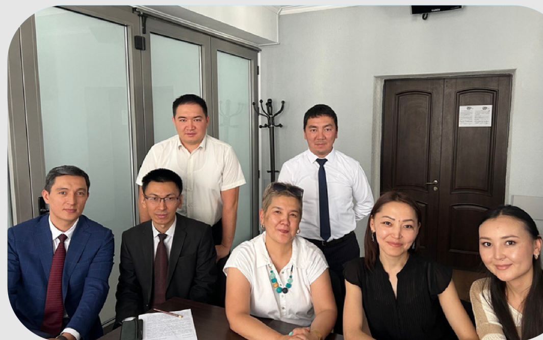
Study tour with the Ministry of Lab. and Social Security to Korea 2022