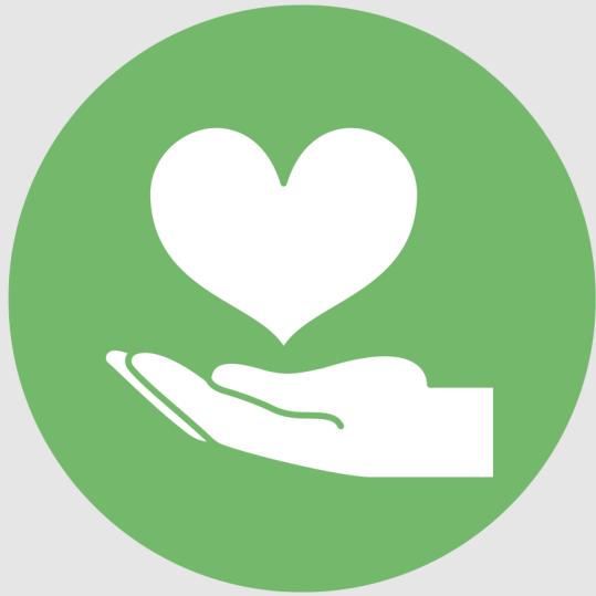
Sponsorship Programme 1999