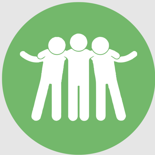
OPs SHGs 2006