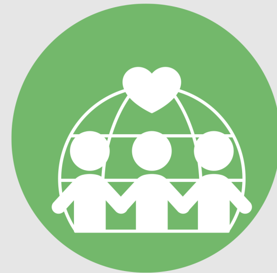
Establishing infrastructure 2014