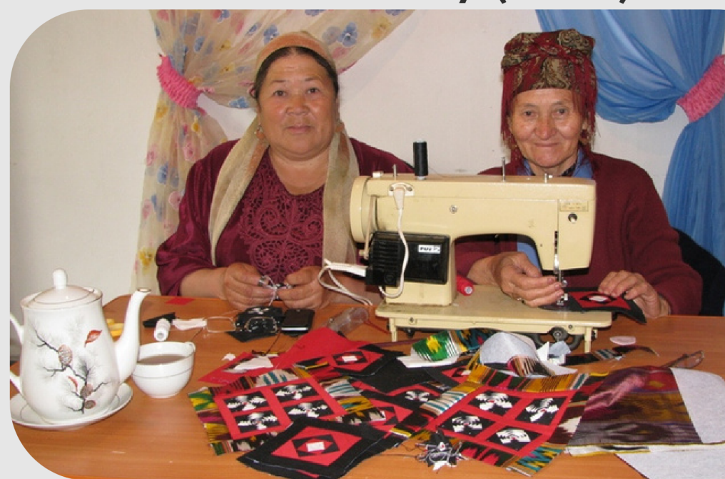
Self Help Groups support (2008)