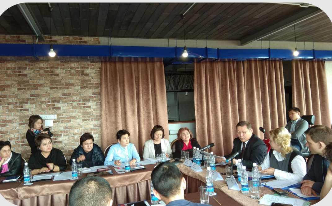
Discussion of the National action plan with CSO (2019)