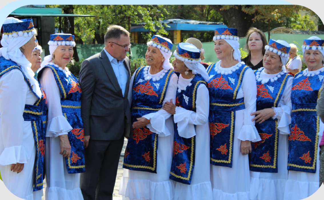
Holding of the actional “from Heart to Heart” with the mayors office in Bishkek city (2023)